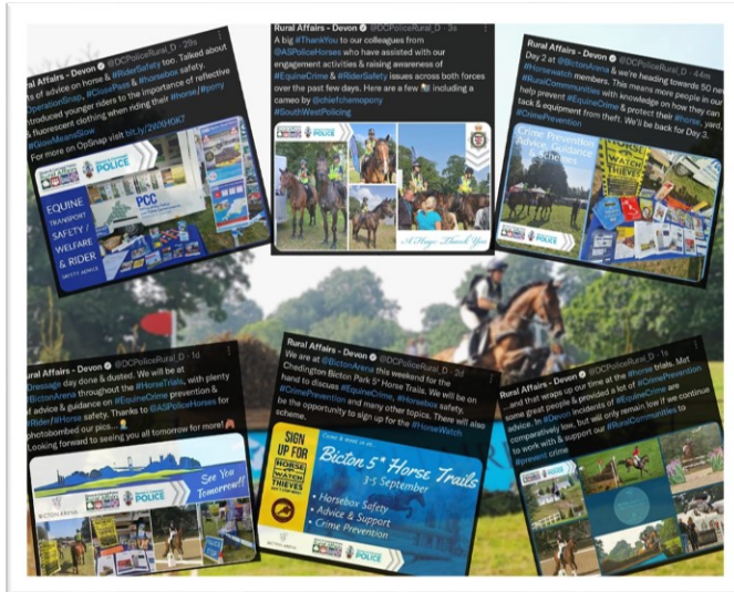
Twitter messages from Bicton

Following on from the summer shows we have continued our engagement activities where we have been able to continue promoting the watch schemes. In September we attended Bicton 5* Horse Trails which were held at Budleigh Salterton, Exeter.