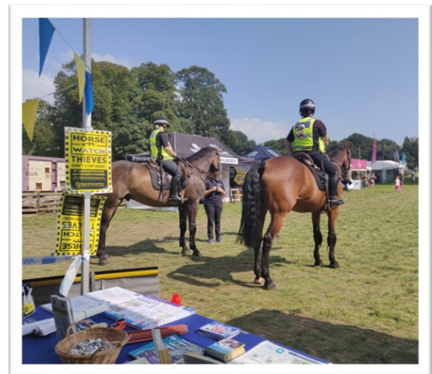
Police horses on best behaviour!

We signed up over 60 new Horse Watch members throughout the event and worked alongside the Avon & Somerset mounted section who had brought along some of their younger horses for some training and experience. You may have seen our updates in Twitter!